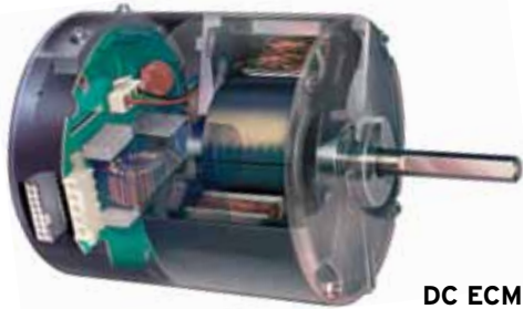
DC ECM Motor

NuAire incorporates our existing technology and new DC ECM technology to give you the best VALUE - lower energy costs, longer filter life, and reduced noise and vibration.