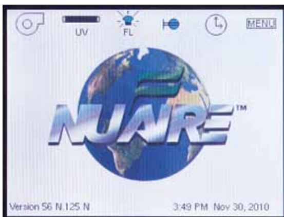
TOUCHLINK™ Electronic Control System Display